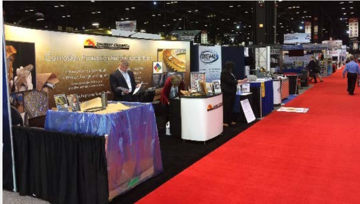
Above: the Daubert Cromwell Booth at Fabtech 2015

Daubert Cromwell, manufacturer of corrosion preventive packaging solutions, exhibited at Fabtech 2015 last month in Chicago. The show was a success, and featured VCI packaging that prevents corrosion on iron, steel, and ferrous metal parts during storage and shipment.