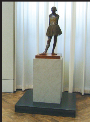
“Little Dancer” Sculpture, Degas

EVAPO-RUST™ safely washes away all surface corrosion to reveal a beautifully restored finish.