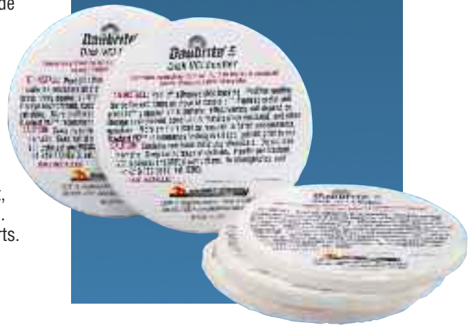
Daubrite Disk Emitters