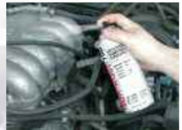
Spray-On Multi-Metal Inhibitor