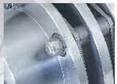
Metal Parts Protection

This selection guide to Daubert Cromwell liquids and powders is intended for general reference only. For complete product information, specific recommendations and selection assistance, call +1-708-293-7750, 800-535-3535, or e-mail info@daubertcromwell.com