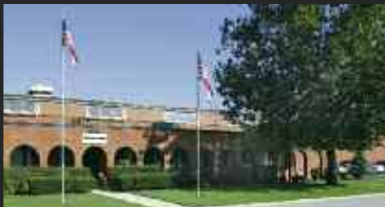
New corporate headquarters and manufacturing facility located in suburban Chicago

and wherever customers need Daubert Cromwell corrosion preventive packaging for their valuable metals.