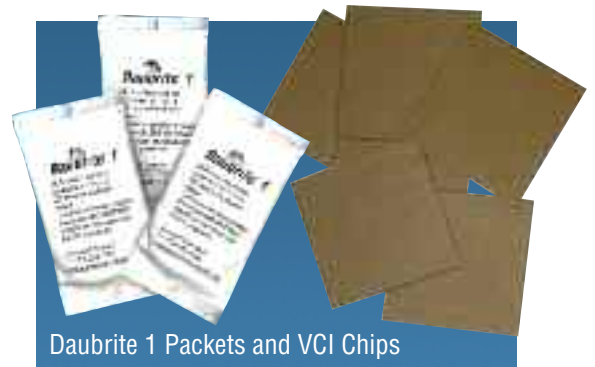
Daubrite 1 Packets and VCI Chips