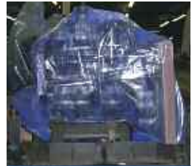
Engine Lay-Up Protection