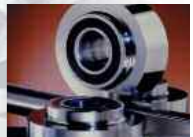
Closed Systems Lubrication